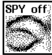
Figure 19.1. SPY Window When SPY is Not Being Used

The function SPY.BUTTON brings up a small window which you will be prompted to position. Using the mouse buttons in this window controls the action of the SPY program. When you are not using SPY, the window appears as in Figure 19.1.