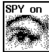
Figure 19.2. SPY Window When SPY is Being Used

To use SPY, click either the left or middle mouse button with the mouse cursor in the SPY window. The window will appear as in Figure 19.2, and means that SPY is accumulating data about your program.